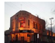
Prince of Wales Hotel Port Road Queenstown 8447 1252