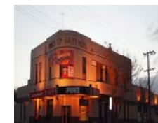
Prince of Wales Hotel Port Road Queenstown 8447 1252

SLUM DOGS Bulldogs Past supporting Bulldogs Present