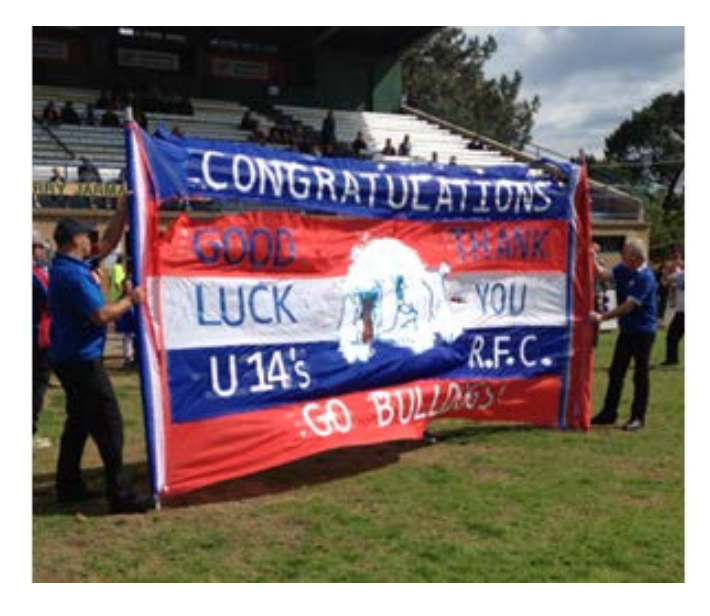
Our double sided banner twice the size as normal – terrific effort!