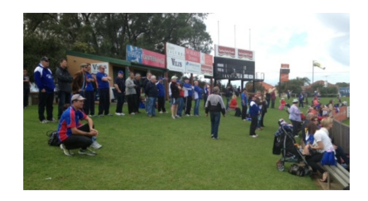
The Bulldog Hill at Woodville Oval