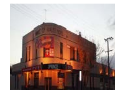
Prince of Wales Hotel Port Road Queenstown 8447 1252