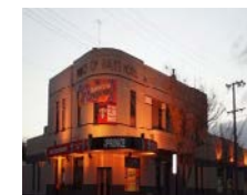
Prince of Wales Hotel Port Road Queenstown 8447 1252